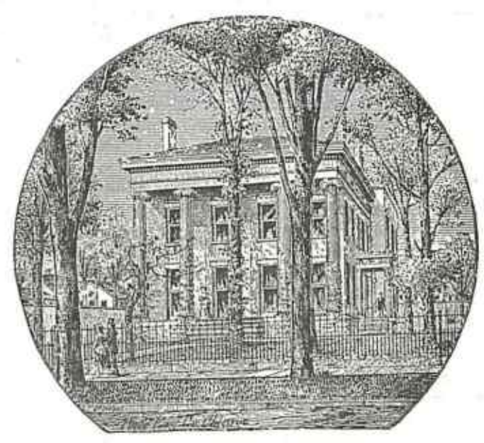
First Union Club building.

A certain group in the Cleveland Club, organized on January 3 this year with quarters on Ontario Street, felt that sports and cards should not predominate. Consequently, "60 or 70 of the most companionable and cultured gentlemen" organized The Union Club of Cleveland on September 25 for the promotion of "physical training and education." William Bingham